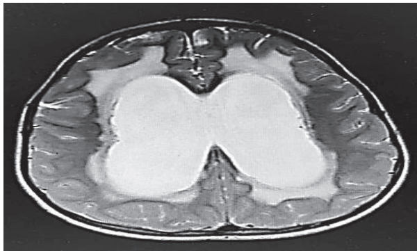
Figure 2: Axial MRI T2-Weighted Image Showing the Enlarged Lateral Ventricles

The pathology of the lesion was Juvenile Pilocytic Astrocytoma (JPA). The tumor was surgically resected. During the procedure, an external ventricular drain (EVD) was inserted. Postoperatively, the patient developed meningitis and ventriculitis. CSF cultures were positive for Gram-negative bacilli ( Acinetobacter MRAB). Initially, intravenous colistin was administered for four consecutive weeks, but there was no clinical improvement of the patient's condition and CSF cultures remained positive. Failure to sterilize the CSF from Acinetobacter with intravenous colistin warranted the intrathecal administration. Colistin was administered intrathecally with a dose of 125,000 IU (10 mg)/day for three weeks. The patient showed improvement clinically, and the cerebrospinal fluid (CSF) culture was negative on the fifth day of treatment.