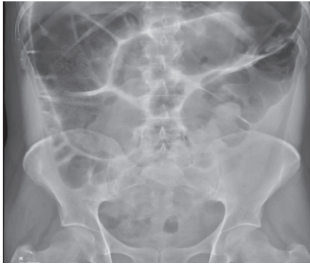
Figure 2: A Supine View Abdominal X-ray Showing Coffee Bean Sign