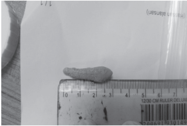
Figure 2: Giant Submandibular Stone