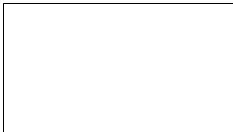
Figure 3. Micrograph of mixed tumor showing characteristic biphasic pattern of ducts and fibromyxochondroid stroma in between. Note, keratinized epithelial plug in a focus of squamous metaplasia (center) (Haematoxylin Eosin x 40)