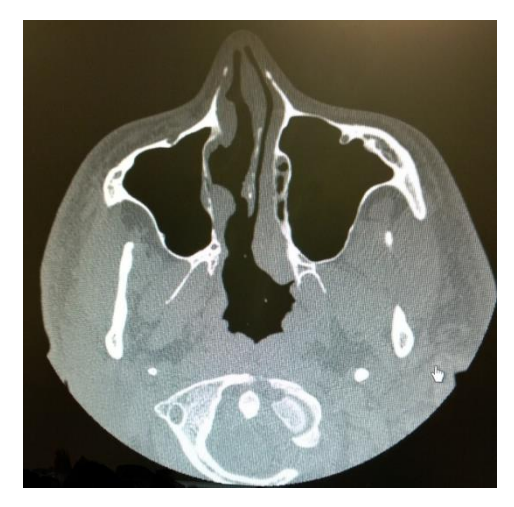
Figures 9-10: CT Sinus Axial View: Patent Right Nasal Airway