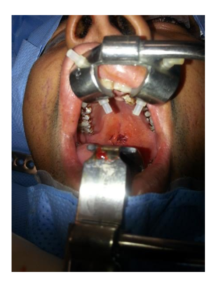
Figure 7: Soft Palate Perforation Repair

Fiberoptic endoscopic examination after one week revealed thick mucus on the right side. The nasal cavity had healed adequately. The patient was advised to continue on nasal douches.