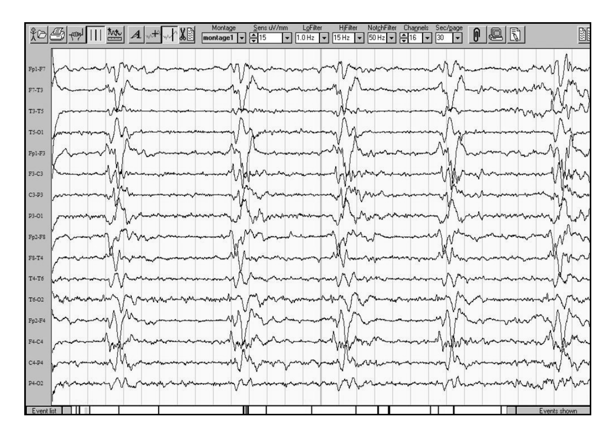
Figure 2: In this EEG record the sweep had been changed to include 30 seconds per page to appreciate the periodic pattern of discharges which is noted every 4-6 seconds

Serology for measles antibodies showed high IgG levels and CSF oligoclonal band was positive indicating intrathecal immunoglobulin synthesis.