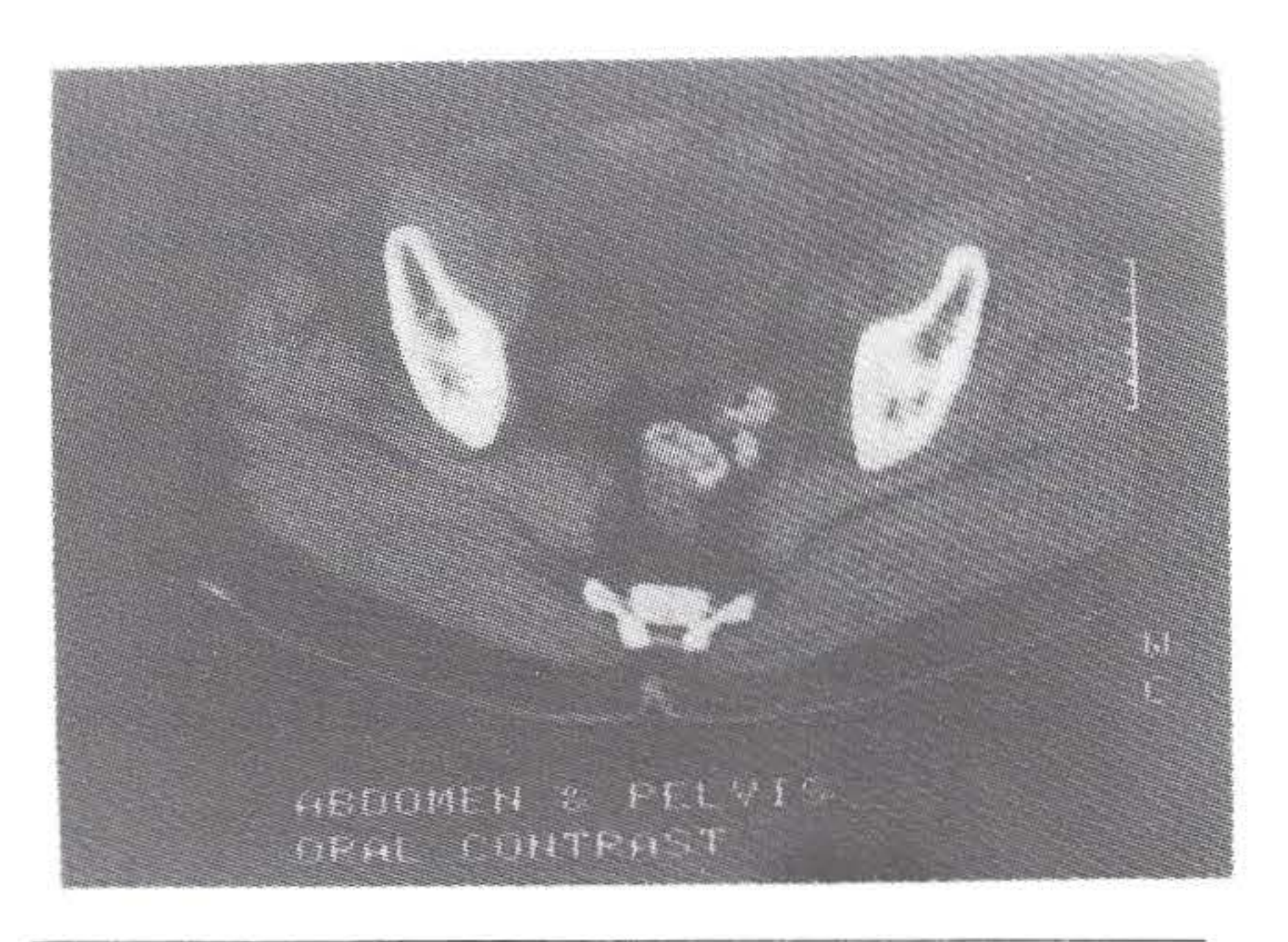
CT scan pelvis