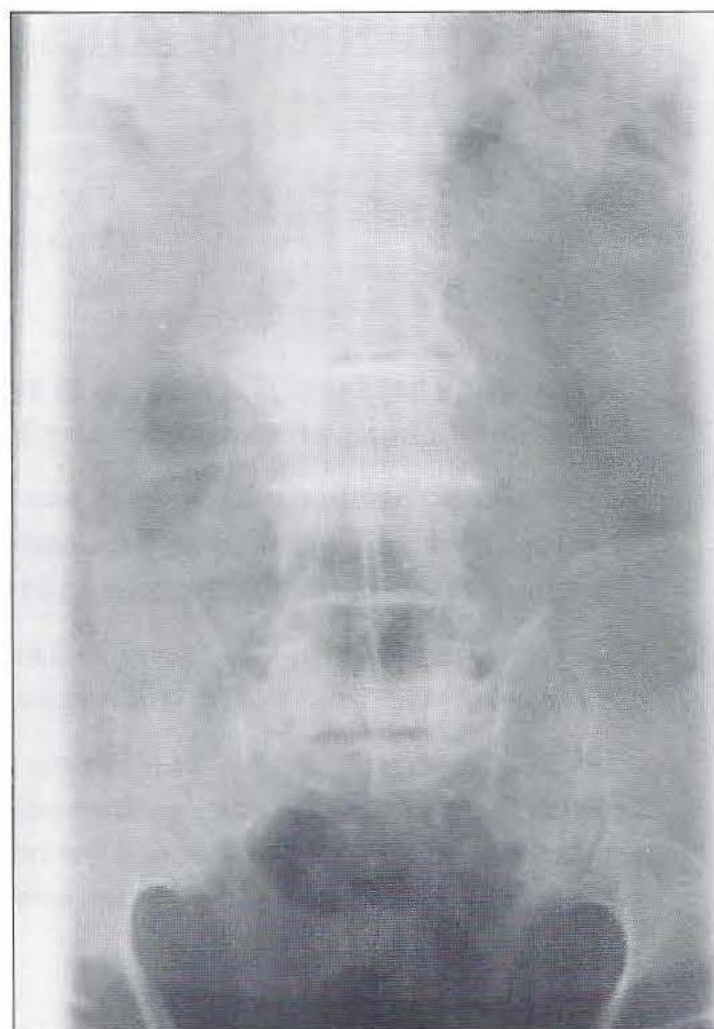
Figure 3: Dense calcification of intervertebral disc spaces