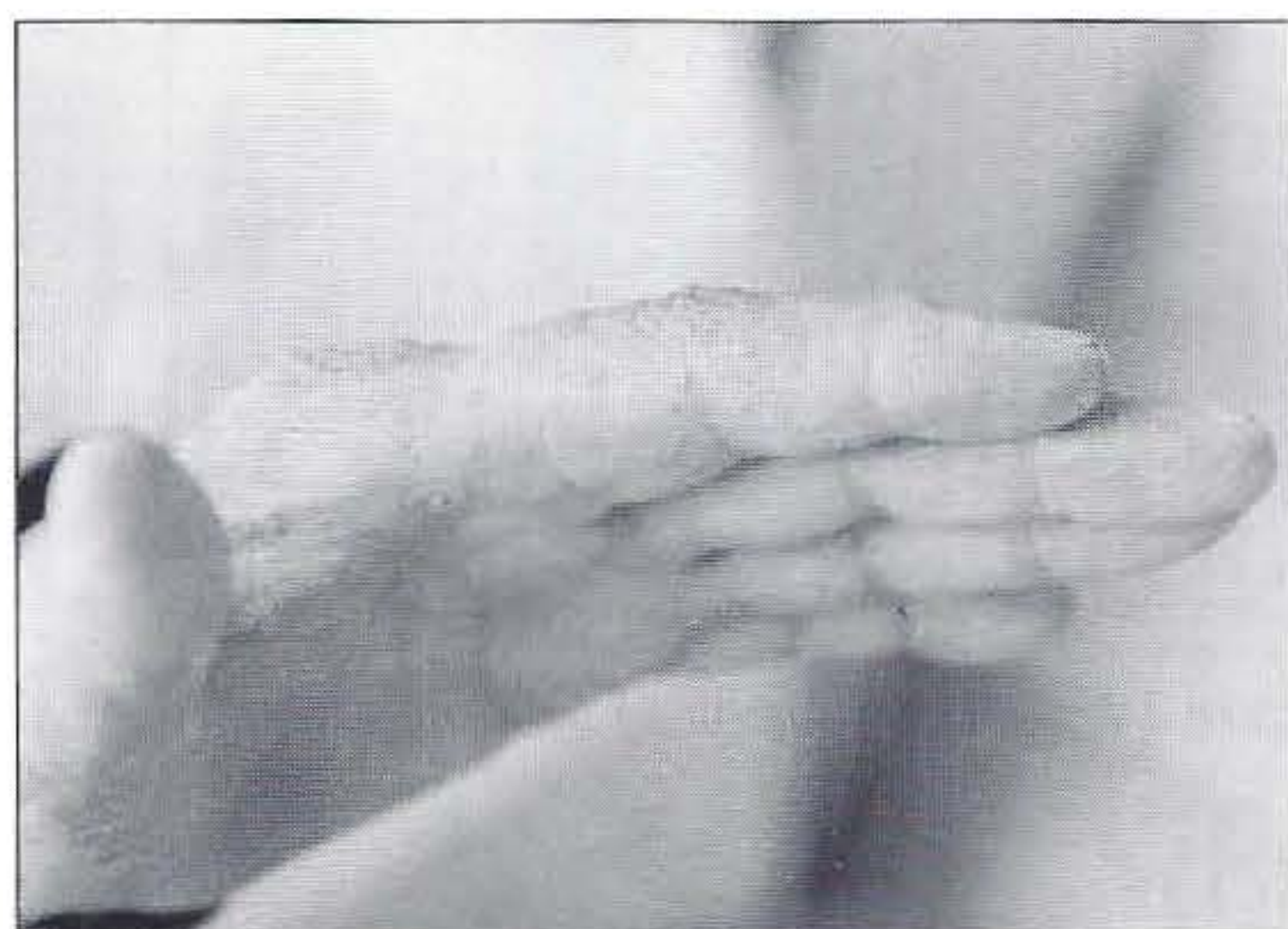
Figure 2b: Pigmentation of the hand