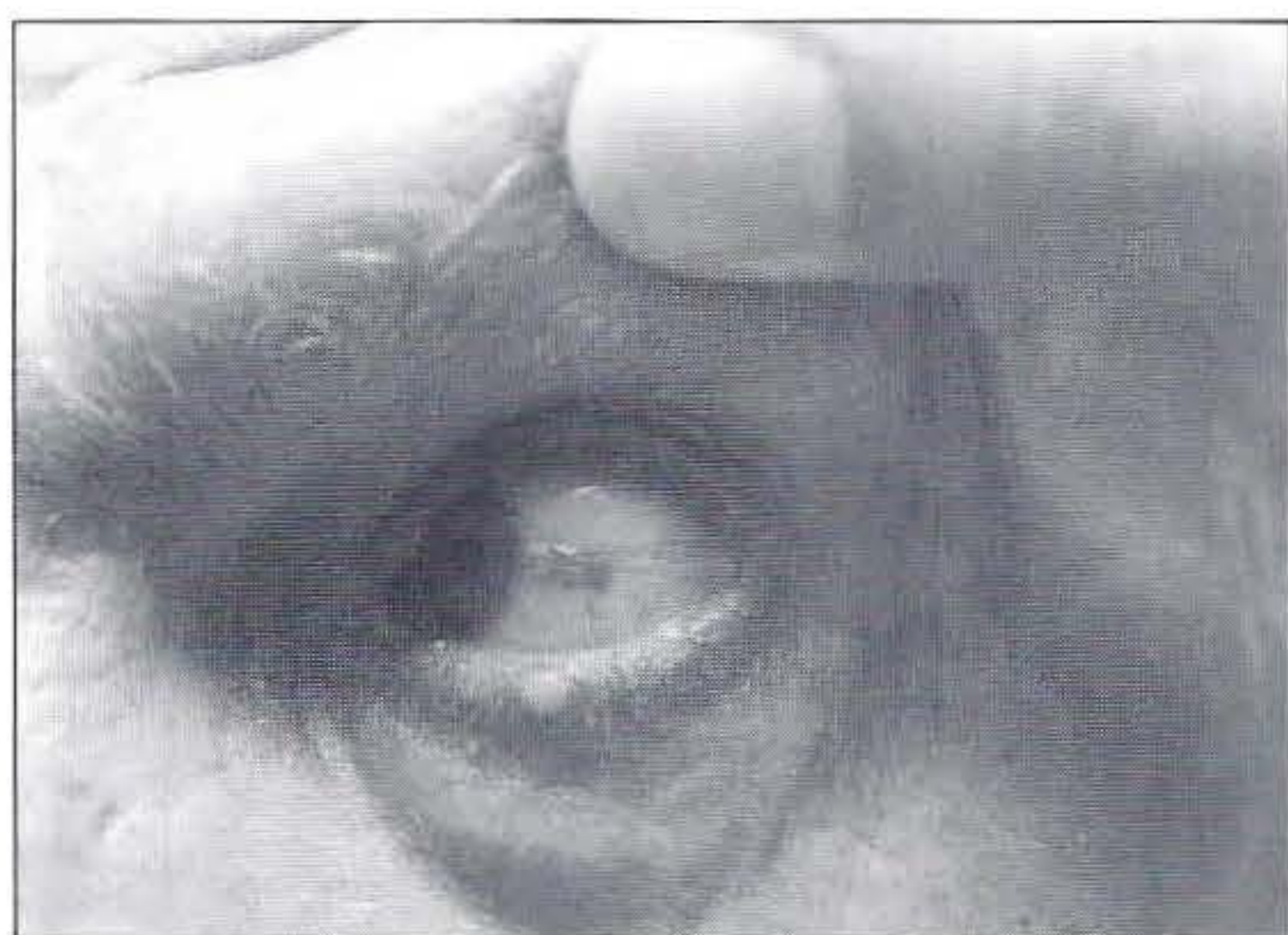
Figure 2a: Pigmentation of sclera and skin surrounding the eye

Alkaptonuria is a rare metabolic disease, the incidence of the disease is 3-5 per million 1-3 , but in the study done at Al-Taybah, we found two cases of alkaptonuria after family screening of three patients previously diagnosed to have Alkaptonuria and four cases in the random study -this is a very high incidence if we compare it with international prevalence of alkaptonuria, so we have to find out the causes of this high incidence. This may be as a result of consanguineous marriage, and as a result of inbreeding within isolated hamlets of this region. The classical triad of darkening of urine, ochronosis and arthritis were found in all of the early three diagnosed patients (picture 1, 2 & 3), one of them had epilepsy of two years duration and controlled by antiepileptic drugs, this is unusual to be found in Alkaptonuria 2,4-6 ); the relationship between alkaptonuria and epilepsy is not known. we wonder whether this is accidentally found or it is a new association; further studies must be carried out to see if there is any other similar association - that will enable us to say that epilepsy is a new association of Alkaptonuria.