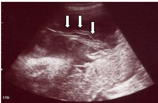
Figure 3: The Amniotic Bands or Sheets Floating Freely in the Amniotic Cavity (arrows)

A forty years old lady, gravida 7, Para 4. Her obstetrics history was uneventful except for previous two miscarriages in the immediate proceeding pregnancy for which she underwent uterine evacuation. She was referred for ultrasound examination at 35 weeks gestations for fetal presentation. Her previous dating and anomaly scans were normal. On scanning, fetal biometry were corresponding to date, however, amniotic band were noted floating freely adjacent to the fetal head and lower limbs (Figure 3). The fetus was seen separate from the membranes. Careful fetal assessment was done and no abnormalities were detected. The mother was counselled regarding the possibilities of the fetus attaching itself to the band with the risk of developing amputation defects. Follow up scan was arranged one week later, which was reassuring. The lady had spontaneous delivery at 37 weeks gestation, a male fetus was born weighing 2890 grams. Physical examination was normal.