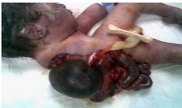
Figure 2: The Baby after Delivery. Note the Amputated Right Arm, the Heart, Liver and Loops of Bowel Protruding through the Defect

Six days later, at 33 weeks gestation, she presented with uterine contraction and liquor drainage. She progressed in labour and had a spontaneous vaginal delivery of a male baby weighing one kilogram and 280 grams. The neonate was born flat with slow and irregular heart beats. The antenatally diagnosed abnormalities were confirmed postnatally. In addition, the right arm was amputated from the shoulder (Figure 2). The infant expired 17 minutes post-delivery.