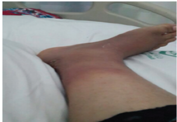
Figure 1 B: Ill-defined Erythematous Plaque

The patient gave a history of receiving several antibiotic treatments for cellulitis without substantial improvement. On examination, she showed fluid-filled lesions on the back of her affected foot. These lesions were pruritic and mildly tender.