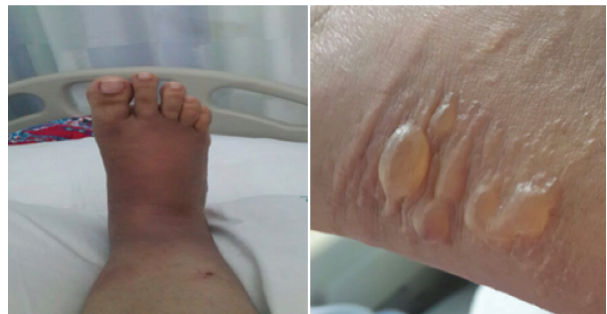
Figure 2: Tense Bullae over the Erythematous Plaque

On the right foot, there were ill-defined erythematous plaques, swelling associated with tense bullae on the back of her foot, see figure 2.