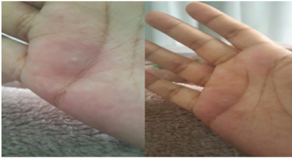
Figure 3: Multiple Infiltrated Papules over the Palms

Scattered erythematous, slightly infiltrated edematous papules over the right thigh and both palms were seen, see figure 3.