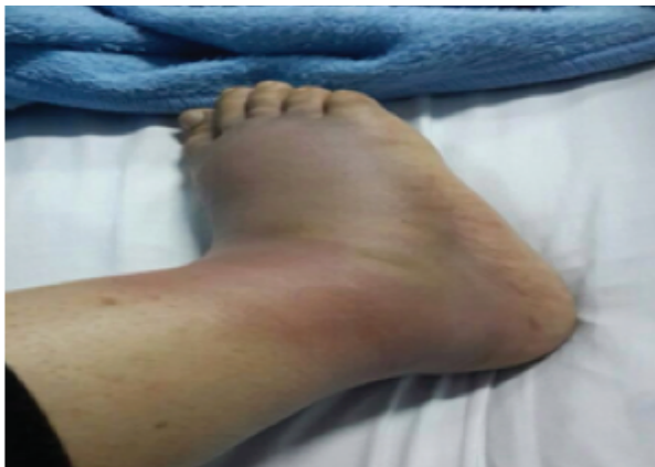
Figure 1 A: Swelling over the Right Foot

A healthy thirty-five-year-old Saudi female presented with a sudden unilateral right foot pain and swelling for almost two weeks, see figures 1 A and B.