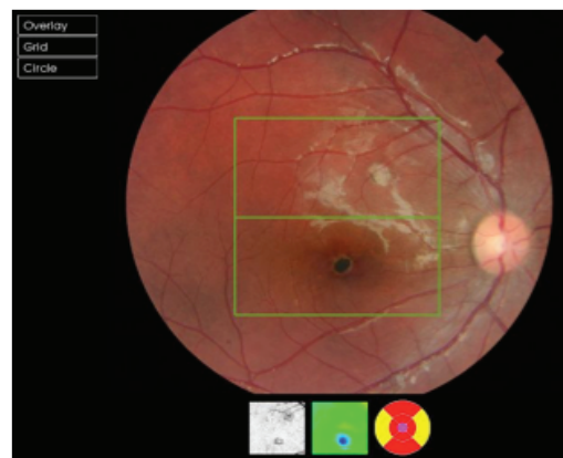
Figure 1: Right Eye Fundus before Reactivation of the Disease

Best Corrected Visual Acuity in her right eye was 6/6 and in left eye 5/60. The cover test revealed a constant left exotropia (15* distance and 10* near). Anterior segment eye examination with slit-lamp was within normal limits. Dilated fundus examination revealed two chorioretinal scars in the right posterior pole and three scars in the left eye posterior pole, one of which was a large involving the whole of the fovea, see figures 1 and 2.