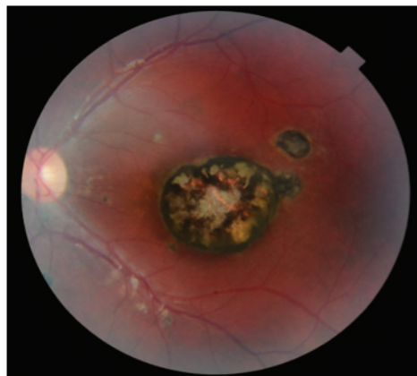
Figure 4: Four Weeks of Spiramycin Showing Regression of Active Retinitis

The patient was treated with oral spiramycin 1500 mg/day in two divided doses with prednisolone tablet (1 mg/kg body weight) for six weeks; the prednisolone was gradually tapered after four weeks. Follow-up OCT revealed regression of active chorioretinitis after three weeks. IgM titers reduced after four weeks. There was no side-effect related to spiramycin, although prednisolone caused facial puffiness and slight water retention. The child was regularly followed up in the Departments of Ophthalmology and Pediatrics for over one year after cessation of treatment with no new lesions appearing in the retina.