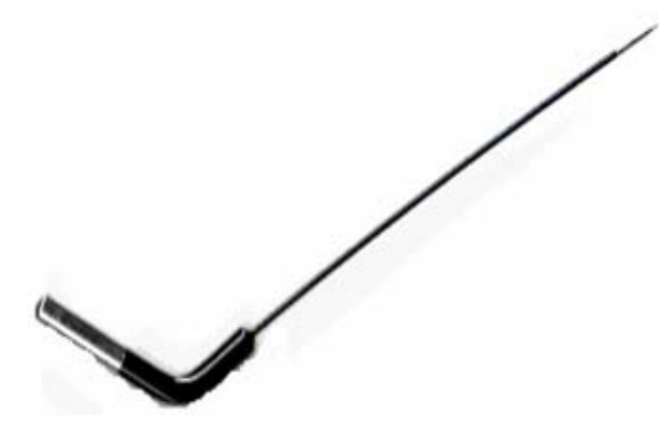
Figure 2: Isolated Cautery Needle

The needle was inserted deep to the conchal bone and withdrawn gradually while the power on (within 4-5 seconds). The strength and length of cauterization is judged by the amount of discoloration of turbinate. There was no bleeding and therefore, no nasal packing was required. The postoperative follow-up schedule was as follows: 2 days, 4 days, one week, 2