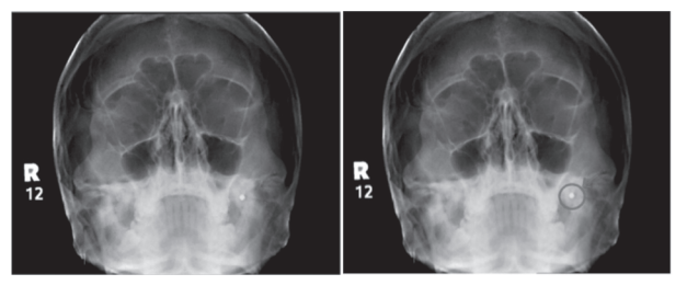
Figure 2: Water's View X-ray Showing the Device

Skull X-ray revealed metallic device trapped in the middle ear, see figure 2. The object looked like a button battery, and batteries being alkaline are considered an ENT emergency due to possible erosion of the ossicles and further insult to the inner ear.