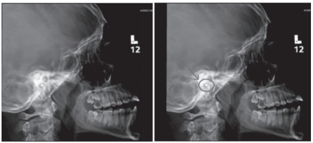
Figure 1: Lateral Skull X-ray Showing the Hearing Aid Device

A twenty-four-year-old Bahraini male presented to emergency with history of insertion of a foreign body in the left ear. The patient was struggling with his examinations and decided to cheat by inserting a hearing device in his external meatus; an amplified phone neckloop was connected to a mobile phone similar to a regular earphone headset. The power is then turned on in the amplified phone neckloop and he would be able to hear voices in his earpiece and talk with his partner. However, the patient inadvertently caused a perforation in the left tympanic membrane and the device was displaced into the middle ear cavity. The foreign body inserted was metallic in nature and could have caused further complications if no intervention was performed, see figure 1.