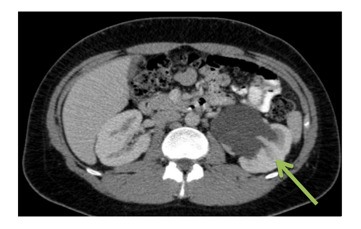
Figure 1: CT Abdomen and Pelvis with Oral and IV Contrast Showing Severe Left Hydronephrosis with Cortical Thickness and a Possible Crossing Vessel at UPJ

A twenty-seven-year-old Bahraini male who presented initially to the general surgery clinic with lower left sided abdominal pain radiating to the back and no urinary symptoms. He was on NSAIDS to control his pain. CBC and urea and electrolytes were within normal limits. CT abdomen and pelvis with oral and intravenous contrast was requested. Marked dilatation of the left pelvicalyceal system with no ureteric dilatation and mild to moderate delay in the excretion were revealed. The possibility of crossing vessel was raised, see figure 1.