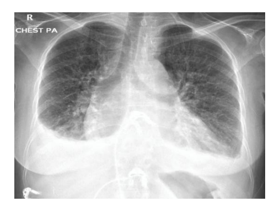
Figure 1: Right Sided Pleural Effusion

Her routine investigation showed TSH 0, T4 21, T4 9 and her WBC 11.6, ALT 364 ALP 143, the rest of her investigations including electrolyte, renal function, lipase and amylase were within normal ranges. Chest x-ray showed cardiomegaly with moderate right sided pleural effusion, see figure 1. ECG showed atrial flutter with variable block. Echocardiography revealed normal left ventricular cavity size with fair global systolic function, ejection fraction 52% and septal and inferior hypokinesia. Clinical impression of thyroid storm precipitated by chest infection was made.