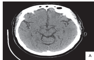
Figure 1 (A)

A sixty-nine-year-old female patient presented with dizziness, confusion, nausea and severe headache of 2 hours duration. Neurological examination revealed acute right-sided cerebellar signs with National Institute of Health Stroke Scale (NIHSS) score of 9 1 . The patient had residual right-sided weakness from a previous stroke two years ago (left MCA territory infarction). The CT was negative for hemorrhage or recent infarction. CTA revealed total occlusion of P2 segment of right PCA, see figures 1 (A) and 1 (B).