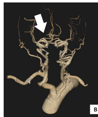
Figure 1 (B)