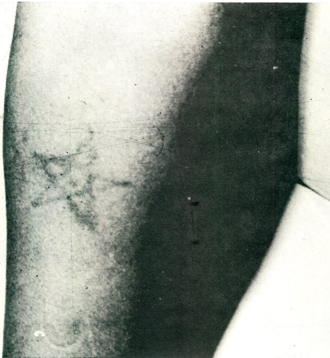
Figure 2b.: Non-professional tattooing after excision and skin grafting.

Often such individuals have attempted to remove a portion of the tattoo themselves by burning (figure 1a) the area with a hot object or abrading the area with salt or sand paper, only to find the procedure painful and the scarring that results as objectionable as the tattoo itself.