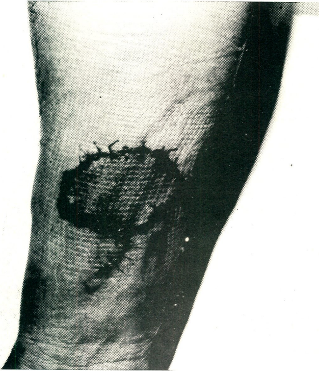
Figure 2a.: Non-professional Tattooing