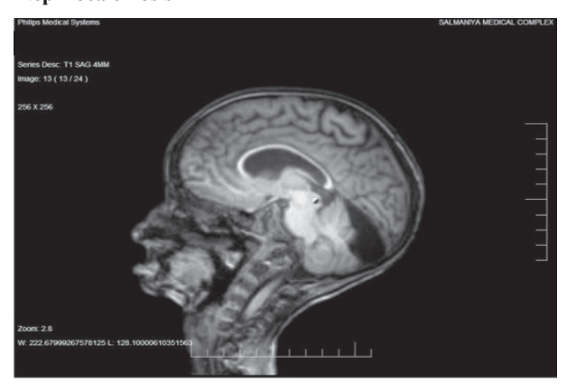
Figure 3: Brain MRI Showing Evidence of Empty Sella Syndrome

Wrist joint X-ray showed no evidence of bone injuries. However, it showed a slight reduction in bone density. Besides, there was a patchy area of increased density within the soft tissue at the medial aspect of the distal forearms just medial and above the distal end of the ulna. These findings are suggestive of soft tissue calcification because of the patient's known history of hypoparathyroidism, see figure 4.