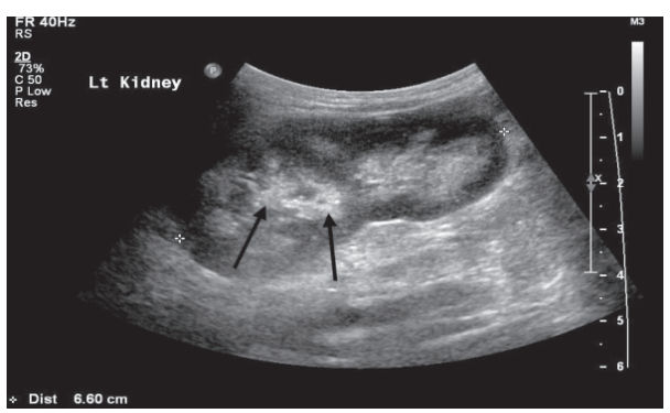
Figure 2: Left Renal Ultrasound Showing Early Changes of Nephrocalcinosis

Abdominal and chest ultrasound revealed no features of pyloric stenosis and normal thymus gland. Ultrasound showed early changes of nephrocalcinosis, see figure 2. Brain MRI showed bilateral symmetrical posterior periventricular hyperintensities, which could be either due to terminal zones of myelination or delayed myelination. Focal dilatation of the temporal horn of the left lateral ventricle was also noted. Besides, evidence of empty sella syndrome (ESS) was found, see figure 3.