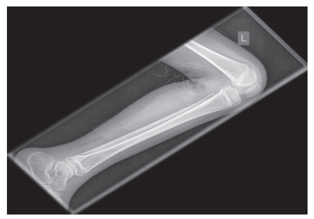
Figure 4: Left leg X-ray Showing Osteopenia

Wrist joint X-ray showed no evidence of bone injuries. However, it showed a slight reduction in bone density. Besides, there was a patchy area of increased density within the soft tissue at the medial aspect of the distal forearms just medial and above the distal end of the ulna. These findings are suggestive of soft tissue calcification because of the patient's known history of hypoparathyroidism, see figure 4.