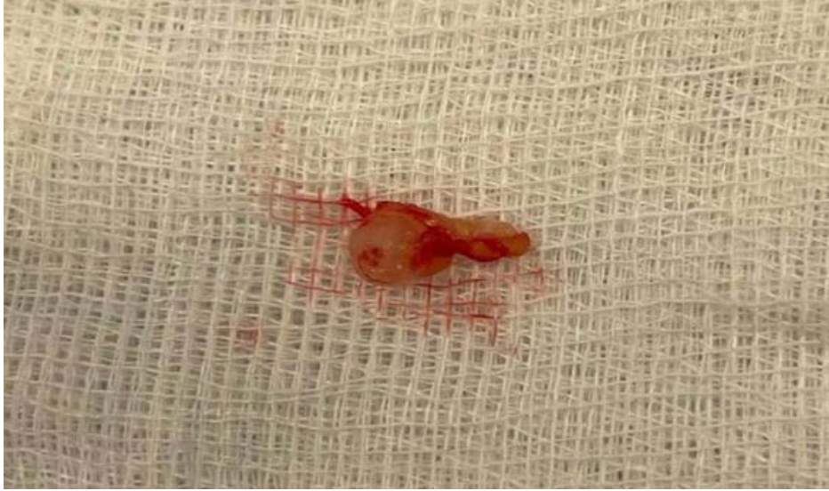
Figure 3: Gross Examination of the Tumor - Post-operative gross examination showed a 10x 8x 7mm solid, well-circumscribed, nodular, and firm tissue with a tan, white cut surface.