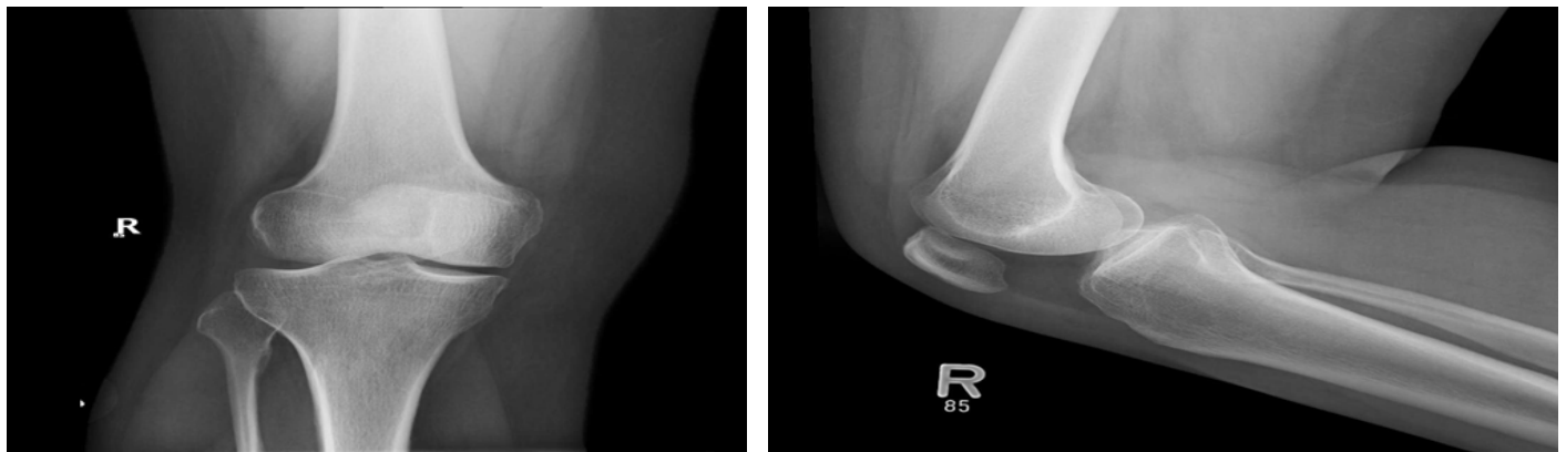
Figure 1A-B: Plain Radiograph of the Right Knee Joint - Pre-operative plain radiograph of the right knee joint, in antero-posterior and lateral views, showed no bony or articular abnormalities, maintained joint space, normal bone density, no fractures, normal soft tissue shadow