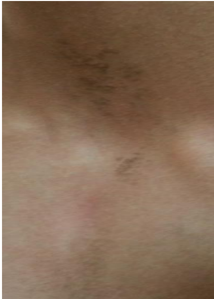
Figure 3: Grayish Brown Papules and Plaques in Reticular Pattern Peripherally (Suprasternal Notch and Supraclavicular Fossa)

The diagnosis of CRP was confirmed histopathologically and clinically, see figure 4 8 .