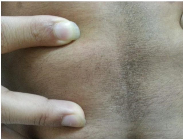
Figure 2: Close View of Grayish Blue Papules and Plaques in a Confluent Pattern on the Midline Abdominal Region