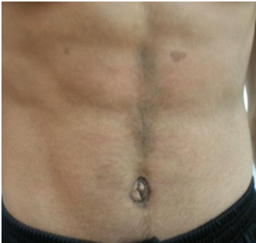
Figure 1: Grayish Blue Papules and Plaques in a Confluent Pattern on the Midline of Abdominal Region

A nineteen-year-old Bahraini male presented with grayish blue hyperkeratotic small papillomatosis at midline of the abdominal region as confluent lesion which spread to form a reticular lesion over the suprasternal notch and on the left supraclavicular fossa. The patient was asymptomatic for 6 months, see figures 1, 2, and 3. He had no response to multiple local antifungal treatments. In addition, there was negative potassium hydroxide fungal test for Pityrosporum orbiculare or Pityrosporum ovale spores.