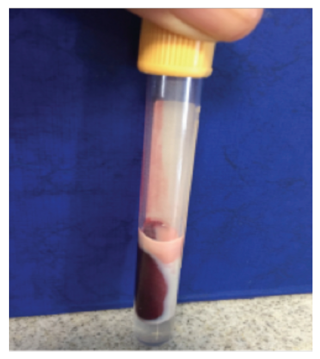
Figure 3: Blood Sample of our Patient on Admission Showing Lipemic Sample

The patient remained stable. A repeat serum triglyceride was performed and had decreased to 1.64 mmol/L and lipase and amylase had decreased to 632 U/L and 223 U/L, respectively, see figure 3. She recovered with insulin therapy and gemfibrozil and did not require additional intervention. She was discharged after 44 days on insulin (insulin glargine 60 units at bedtime and insulin aspart 12 units three times daily), gemfibrozil (600 mg twice daily) and omega-3 fatty acids (2 g three times daily).