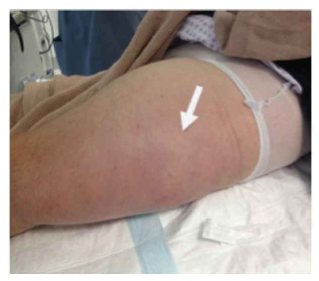
Figure 1: Left Thigh Fluctuating Swelling

One month later, the swelling increased involving the posterolateral aspect of the left thigh, fluctuant with no neurovascular deficits, see figure 1. The patient was admitted to the hospital immediately, and incision and drainage of the hematoma were performed under general anesthesia.