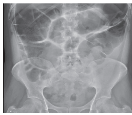
Figure 2: A Supine View Abdominal X-ray Showing Coffee Bean Sign