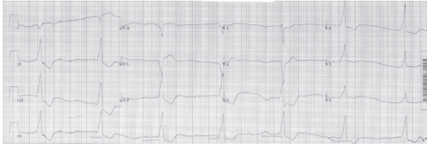
Figure 1: Complete Heart Block with Heart Rate of 42/minute and Wide QRS Escape Rhythm

showed a heart rate of 42/minute, complete heart block with a wide QRS escape rhythm, see figure 1. He was conscious and responsive. Cardiovascular and systemic examinations were normal.