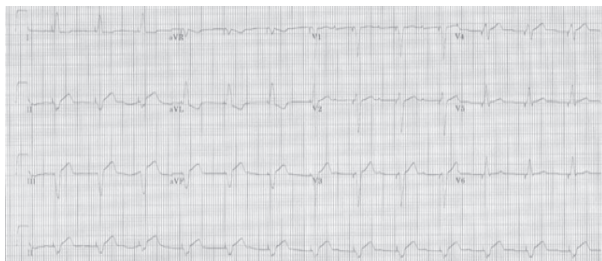
Figure 3: ECG Post Pacemaker Shows Regular Pacing Spikes

Twenty hours post-surgery, the child had repeated attacks of Stokes-Adams syncope. Telemetry revealed complete heart block, heart rate 40/minute with the absence of pacing spikes. Chest X-ray showed the same lead position as before. Urgent bedside PM assessment revealed lead impedance of 585 Ohms but very high capture threshold, suggestive of lead failure due to exit block. He underwent urgent surgical replacement of previous lead with a Medtronic Myodex™ fixation screw lead.