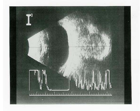
Figure No 2: A & B scan of the right eye and orbit.