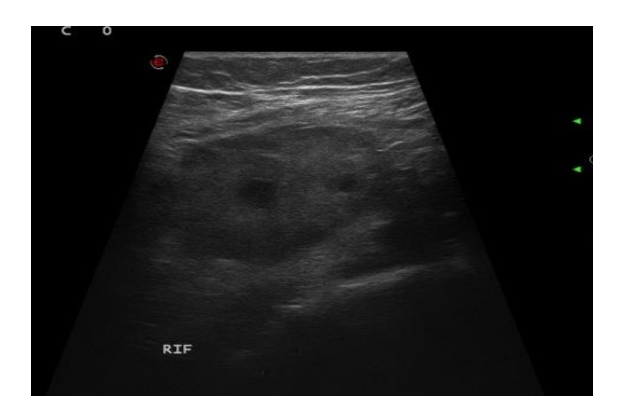
Figure 2: Transabdominal Ultrasound with Color Doppler Shows Interval Regression in Size of the Ovary with Reduced Peripheral Vascularity and Decreased Arterial Flow Around