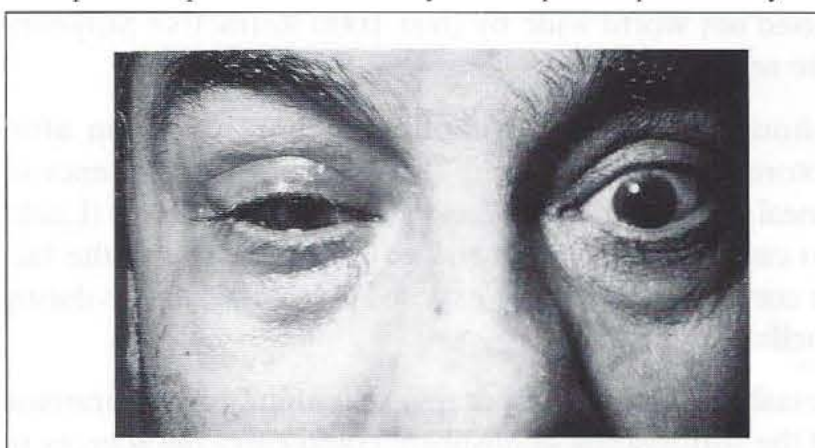
Figure 2: Three weeks after lasik surgery to both eyes showing right bacterial keratitis

The patient presented on day 22nd post-operatively with