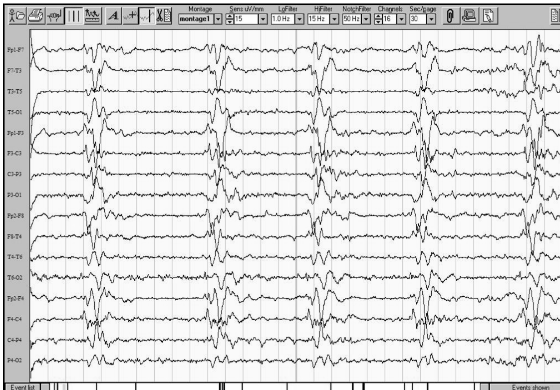
Figure 2: In this EEG record the sweep had been changed to include 30 seconds per page to appreciate the periodic pattern of discharges which is noted every 4-6 seconds

Serology for measles antibodies showed high IgG levels and CSF oligoclonal band was positive indicating intrathecal immunoglobulin synthesis.