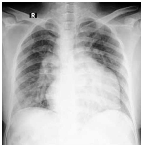
Figure 1. A chest X-ray revealed dextrocardia with cardiomegaly and lung inflammation.

of 98 bpm. She had a normal jugular venous pressure, a respiratory rate between 22 and 24 breaths per minute, and no indications of clubbing or cyanosis. No evidence of congestive heart failure was detected. Upon cardiovascular assessment, the apex was positioned in the right 6th intercostal space, a grade 2/6 systolic murmur was heard along the right parasternal border, and rhonchi were heard in dextra hemithorax.