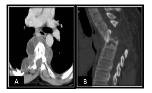
Figure 1: CT Dorsal Spine Image Showing D4-5 Localized Kyphosis, Paravertebral Multi-Loculated Cystic Collections and Compression of Dorsal Spinal Cord

CT of the dorsal spine showed localized kyphosis at the level of D4-5 with erosions at the vertebral end plates and sizable paravertebral multi loculated cystic collections with widening of spinal canal and compression of dorsal spinal cord, see figure 1.