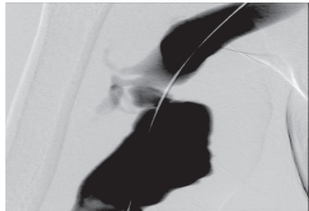
Figure 1: Stenotic Lesion within Right Basilic Vein

and catheter. Angioplasty was performed using a 12mm x 4cm balloon; this was followed by the deployment of a self-expandable stent within the stenosis 8mm x 6cm. Stent sizing was based on the operator's judgment after balloon angioplasty; ultrasonography was not used for sizing the stents.