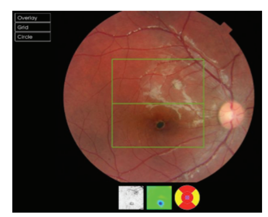
Figure 1: Right Eye Fundus before Reactivation of the Disease

Best Corrected Visual Acuity in her right eye was 6/6 and in left eye 5/60. The cover test revealed a constant left exotropia (15* distance and 10* near). Anterior segment eye examination with slit-lamp was within normal limits. Dilated fundus examination revealed two chorioretinal scars in the right posterior pole and three scars in the left eye posterior pole, one of which was a large involving the whole of the fovea, see figures 1 and 2.