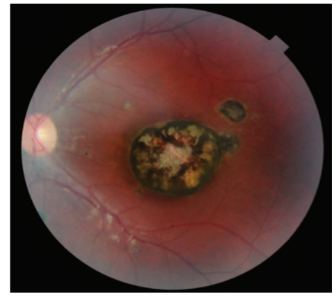
Figure 4: Four Weeks of Spiramycin Showing Regression of Active Retinitis

The patient was treated with oral spiramycin 1500 mg/day in two divided doses with prednisolone tablet (1 mg/kg body weight) for six weeks; the prednisolone was gradually tapered after four weeks. Follow-up OCT revealed regression of active chorioretinitis after three weeks. IgM titers reduced after four weeks. There was no side-effect related to spiramycin, although prednisolone caused facial puffiness and slight water retention. The child was regularly followed up in the Departments of Ophthalmology and Pediatrics for over one year after cessation of treatment with no new lesions appearing in the retina.