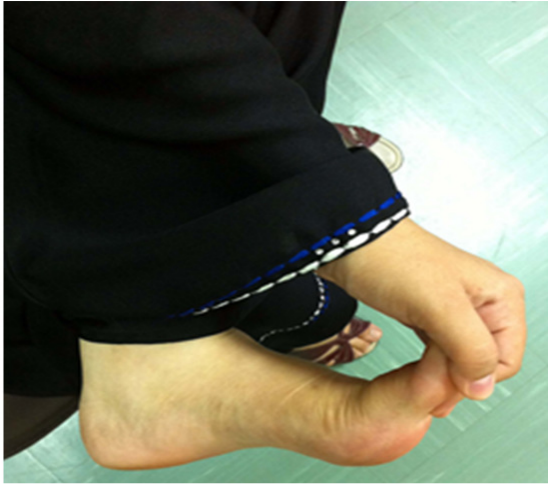
Figure 2: Stretching Exercise

hold and stretch it and count to 10 then releases it. The exercise should be repeated 10 times each session, three sessions a day, see figure 2.